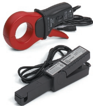
Illustration shows high performance current probes from Tektronix Inc.

Normally the probe provides a method of mechanically splitting the magnetic circuit to enable the conductor to be inserted. The position of the conductor within the loop has relatively little effect upon the measurement.